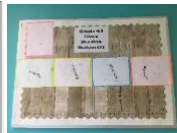
The Gr. 4-5 Mission Statement is #SWAG it stands for Success, Willpower, Attitude and Goals.

We celebrate achieved WIGs on Wednesday mornings at assembly. Watch for photos on Facebook of students achieving their WIGS, or stop in and watch the assembly starting at 9:00am.