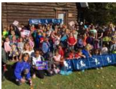
SJS honour's Terry Fox on September 27, 2017!